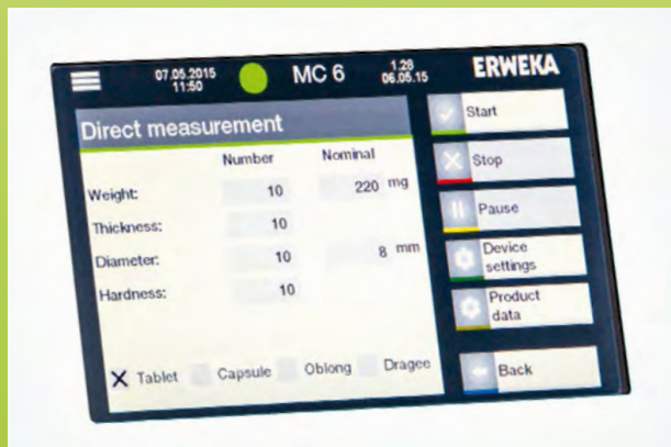
Direct measurement menu for quick starting tests.