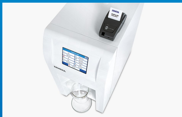
Quick documentation via mobile thermal printer