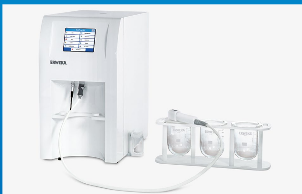
Filling with dosing hand directly into vessel