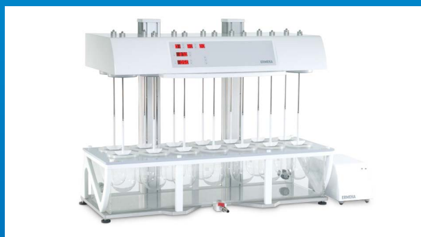
Low-Head, High-Head and cleaning positions possible