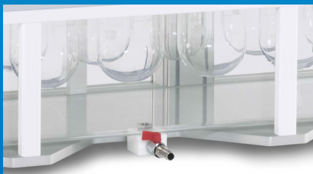
Easy to clean acrylic water bath with outlet valve