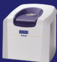
Pulsar: high resolution benchtop NMR spectrometer

This publication is the copyright of Oxford Instruments plc and provides outline information only, which (unless agreed by the company in writing) may not be used, applied or reproduced for any purpose or form part of any order or contract or regarded as the representation relating to the products or services concerned.